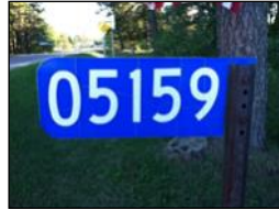
These are the signs you want to keep!

Go ahead and remove the old red fire signs, but be sure to leave the blue and white address signs in place - they are your address for emergency services.