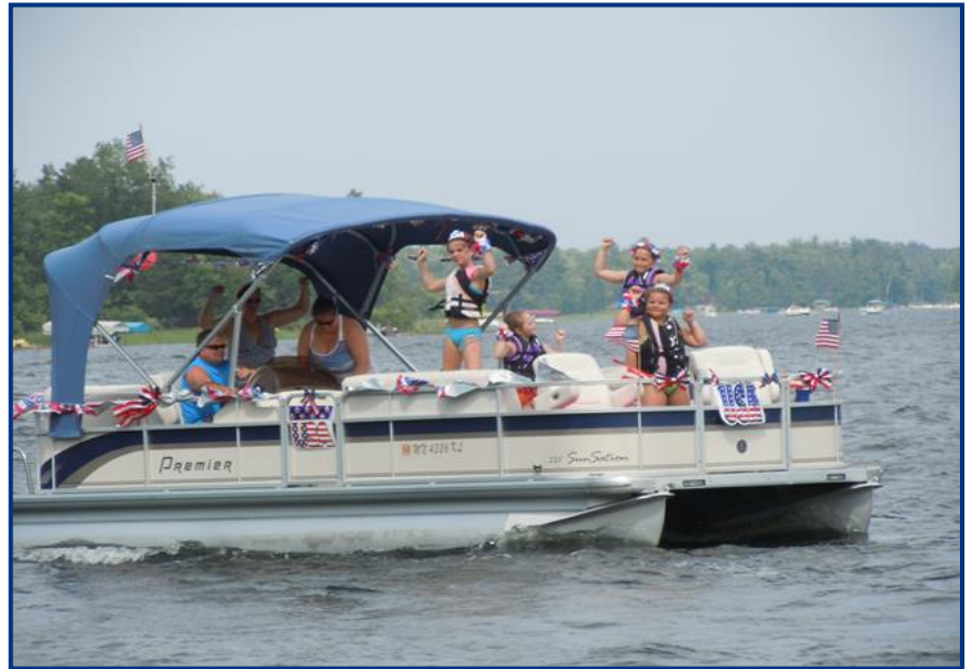
Everybody dance now! 🎵