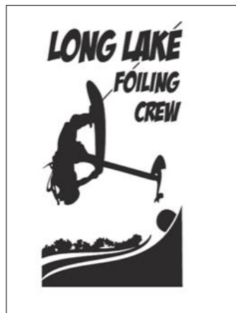
New logo for the Long Lake Foiling Crew

For a more detailed explanation of how a hydrofoil works, go to http://www.hydrofoil.org/WhatIs.html .