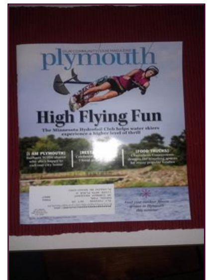
MJ made the cover of the Plymouth, MN community magazine this past June.