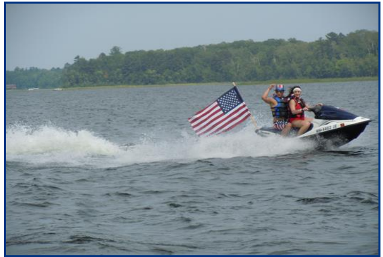
Who says bigger is better?