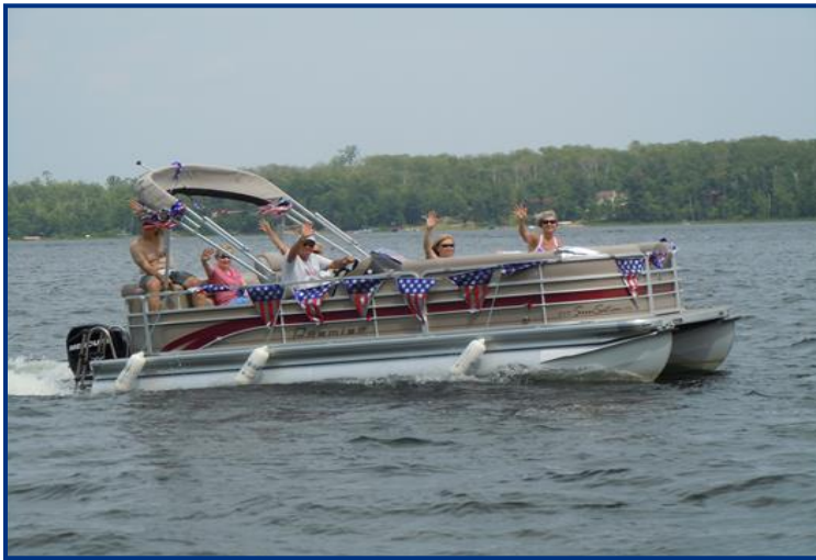
These guys must have gotten together ahead of time to rehearse their parade wave.